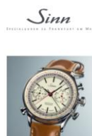
THE 2016/2017 CATALOGUE