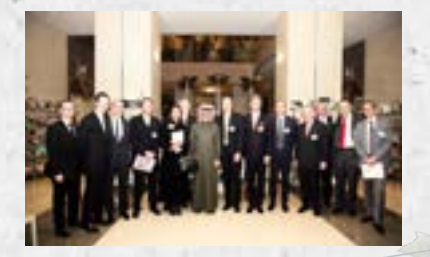
2012 Signing Ceremony of the MoU.

GESALO Meeting with Prince Al-Waleed 2010 bin Talal bin Abdulaziz al Saud.